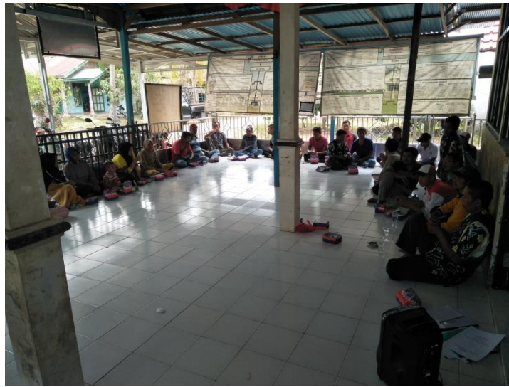
Figure 2. Village Development Planning Deliberations

"The Musrenbangdes that was held discussed the priority of village funds, where each interested party submitted a proposal for activities to be carried out by the village government for the benefit of the village community. Proposals for activities do not only come from the village government, but also from the community. Incoming proposals will be accommodated and compiled based on the priority scale and village goals. The decisions taken are usually through consensus, but if an agreement cannot be found, a voting mechanism will be carried out." (Interview, 2 August 2021).