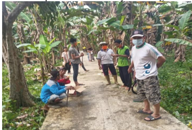
Figure 4. Community involvement in village development through the Village Cash Intensive Work program

Based on the results of the interviews above, the implementation of village development involves community participation. Community involvement in the village development process is expected to be able to provide value added income for community members through village cash-intensive projects. With community involvement, it is hoped that it will increase the sense of community among the villagers. In addition, involving the community in the development process causes the community to trust development projects and programs more because they know the ins and outs of the project and share a sense of ownership of the results of village development (sense of belonging) which in the end the community participates in maintaining and caring for the results of development carried out by the village.