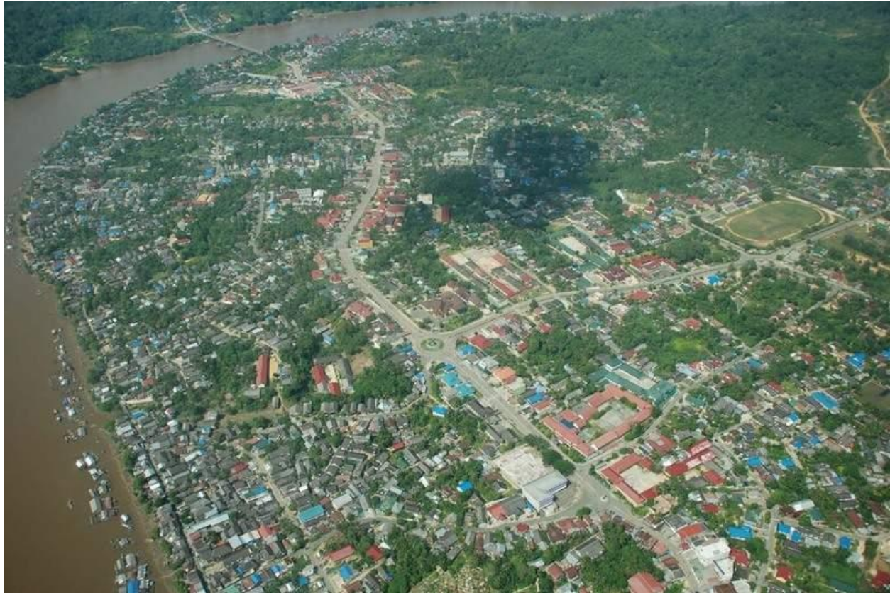
Figure 1. Topography of the North Barito Area

The research results show that the allocation of village funds goes through a series of well-organized stages to ensure that the use of these funds is effective and transparent. These stages include village development planning with collaboration between the village government and the community, preparation of the RPJMDes, data collection on village potential and conditions, submission of the RKAD, approval of the RKAD by the district or city government, disbursement of village funds, implementation of development programs, monitoring and evaluation, financial reporting, and final evaluation. The ADD accountability mechanism is integrated with APBDesa accountability to maintain order and compliance with applicable regulations.